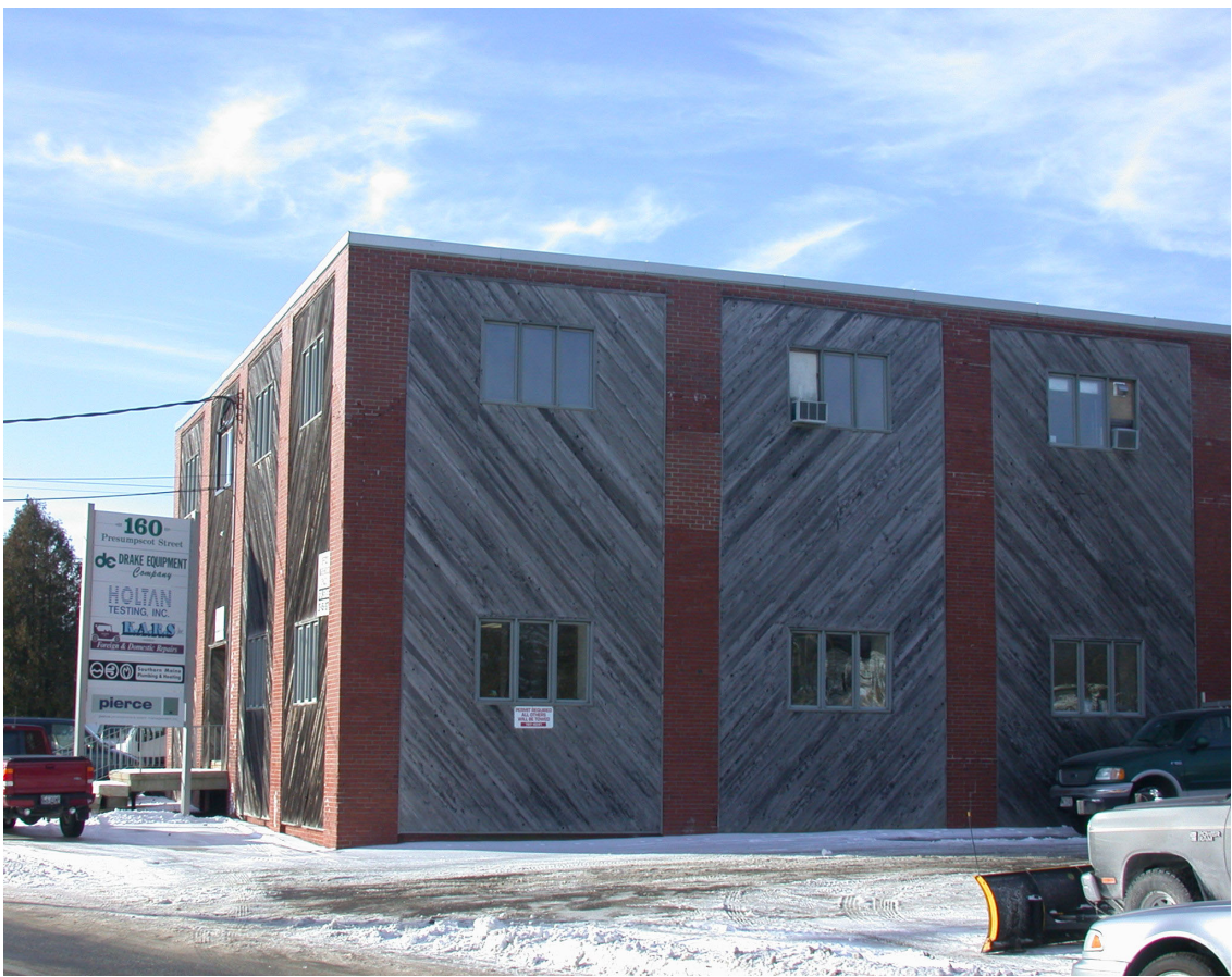
160 Presumpscot Street, Portland, Maine