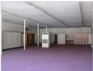
3,680+/- SF RETAIL OR OFFICE SPACE AVAILABLE -IDEAL FOR CONVENIENCE, STATE LIQUOR, HARDWARE, OR SIMILAR RETAIL STORE