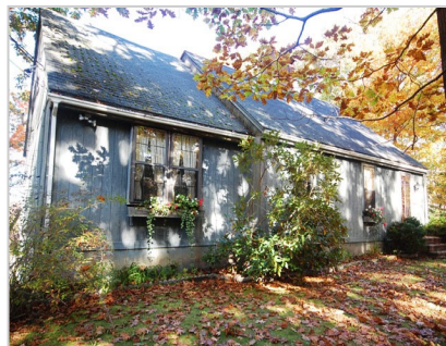
DEEDED BEACH RIGHTS & GREAT MARSH VIEWS

Executive 4 bedroom, 3.5 bath home on 1.8 acres, 3 car garage, stainless steel kitchen, radiant heat, hardwood, full finished basement. This house is stunning! MLS 949443 - $ 695,000