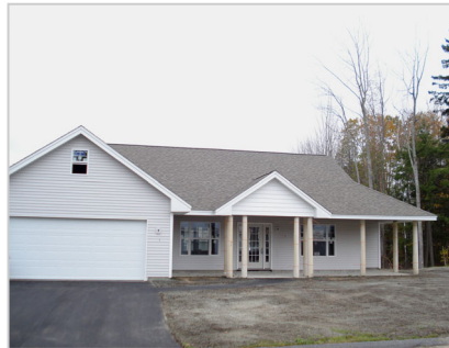
LAST REMAINING SINGLE FAMILY WITH POND VIEWS

Gorgeous 2 bedroom, 2 bath condo with 2 fireplaces, sunroom, heated basement & AC. Large deck overlooking woods. Clubhouse & walking trails. MLS 953897 - $ 269,900