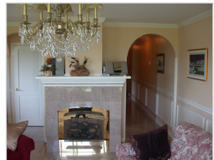
SOME OF THE BEST BEACH & PIER VIEWS AVAIABLE

Solid home with outstanding views Of Rachel Carson Wildlife Preserve & Little River. Deeded rights to New Barn Beach. Million dollar views for 1/2 the price! MLS 960007 - $ 549,900