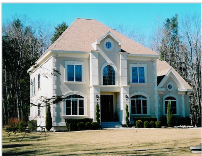
OTHER LOTS & PLANS AVAILABLE

TO BE CONSTRUCTED 2 bedroom, 2 bath, 2 car garage home located in newer 27 lot subdivision near beach & golf. Private road maintained by association. MLS 934681 - $ 259,000