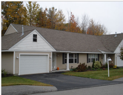
END UNIT WITH WOODED BACK YARD OFF LARGE DECK