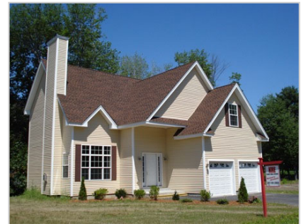
SIMILAR HOUSE AS SHOWN TO BE CONSTRUCTED

2 bedroom, 2 bath 1,680+/- sf single family in 55+ condo community. Breakfast nook, pond views, porch, & 2 car garage. Clubhouse & walking trails. MLS 810673 - $ 289,990