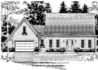
SIMILAR HOUSE TO BE CONSTRUCTED AS SHOWN

All the amenities of condo living in this 2 story home. Large kitchen, wood burning fireplace, & on site pool. Low condo fees! MLS 950944 - $ 139,990